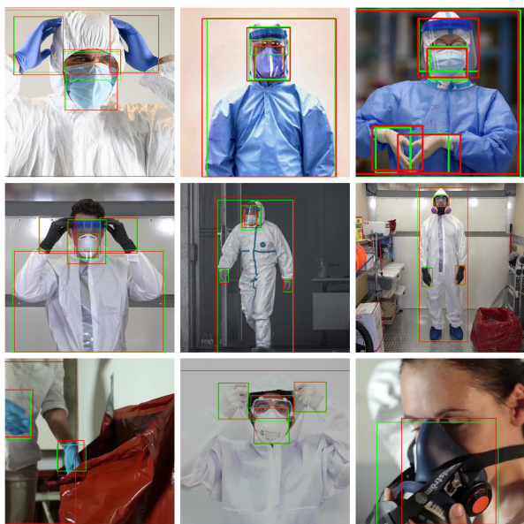
FIGURE 3. Some instances of MPPE detection (Green box is the ground truth and red box for detection).

In conclusion, our study evaluated various models and introduced a novel approach to MPPE detection based on the YOLOv7 algorithm, which currently stands as the fastest and most accurate object detector. Our proposed model achieved an optimal mAP of 90.93% on the CPPE-5 dataset with five classes and over 1029 images, surpassing the results of previous studies. The significance of our findings lies in the effective and accurate detection of MPPE, which is critical for the health and safety of healthcare professionals and the general public. Our study has significant implications for future research, as our proposed model can be extended to other medical image analysis tasks requiring speed and precision, such as patient diagnosis and medical equipment detection. Additionally, future research can focus on developing larger datasets with more classes to expand the scope of our model to detect other medical objects, such as instruments and devices. We recommend further research into integrating our proposed model into existing healthcare systems to enhance the safety of healthcare professionals and patients. Improving the model's interpretability and addressing complex issues will aid in building credibility and public confidence in the model. Our research contributes to on-